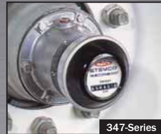
347-Series Aluminum Hub cap with Hubo Window

The STEMCO Hubodometer ® is warranted for 500,000 miles when installed in accordance with its specifications. See your STEMCO distributor for details.