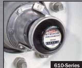
610-Series Bracket Installation

STEMCO - USA P.O. Box 1989 · Longview, TX 75606-1989 (903) 758-9981 · 1-800-527-8492 · FAX: 1-800-874-4297 www.stemco.com