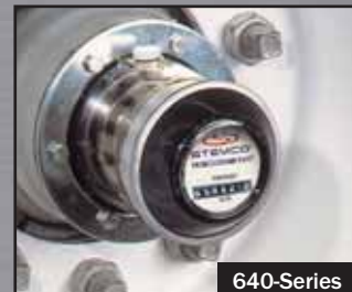
640-Series Grilamid Hubodometer ® Hub Cap